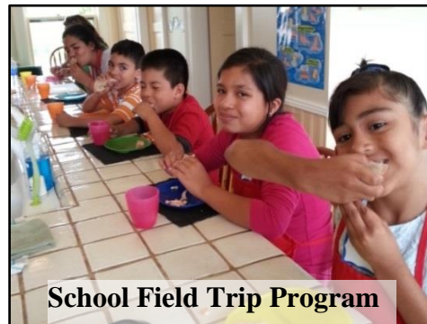
School Field Trip Program

The purpose of our children's program is to improve eating behaviors and environmental stewardship by instilling a love for food at an early age. The Program delivers a highly effective model of environmental and health science curriculum in our indoor/outdoor laboratory. Children rotate through three structured sessions of hands-on science, gardening, and culinary and nutrition lessons. Olivewood is an extension of the classroom and lessons are tied directly to Common Core Curriculum and Next Generation Science Standards. Research has demonstrated that multiple positive experiences with food early in life lead to healthy lifelong eating habits.