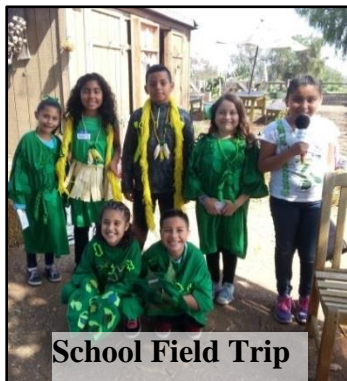
School Field Trip

During the 2015-2016 school year, we served 1794 students and 712 adults including our partnership program with National School District which directly served 489 children and 170 teachers and parent chaperones.