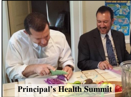
Principal's Health Summit

Our Teacher Training Academies give educators the tools to bring nutrition and garden education into the classroom, helping to grow healthy children who are better prepared to learn. Trainings focus on planning and designing school gardens, basic gardening skills, curricular connections, outdoor class management, and food preparation and handling, among other topics. This year we hosted two Creating and Sustaining Your School Garden (CSYSG) trainings, one Generating Healthy Eaters training, and led a customized professional development training for Kimball Elementary, a local school.