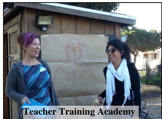
Teacher Training Academy